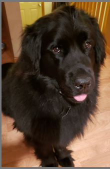
Read to Tessa